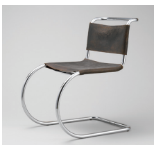
Ludwig Mies van der Rohe, MR10 chair, 1927 housed at the National Crafts Museum, Photo: S&T PHOTO © 2021

Design is an approach to a new type of manufacturing intended to address issues that emerged through modernization. This exhibition traces design currents from a roughly 100-year period through works in the museum collection, beginning with the Arts and Crafts movement of the late 19th century, and continuing on to modern design, as exemplified by Art Déco, Art Nouveau, and the Bauhaus, and post-World War II developments.