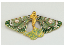
René Lalique, Brooch, Winged Sylph, c.1898, housed at the National Crafts Museum

The French craftsman René Lalique (1860-1945) was active both in the fields of jewelry and glass. This exhibition, drawn primarily from the Luchi Collection (deposited at the National Crafts Museum), focuses on Lalique's creations along with craft and design works of the same era. Savor the world of French decorative art through Lalique's jewelry and glass art as well as epoch-defining furniture and posters.